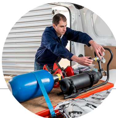
Mobile service - (Engineer will come to you with a fully equipped vehicle, spare parts and test equipment)