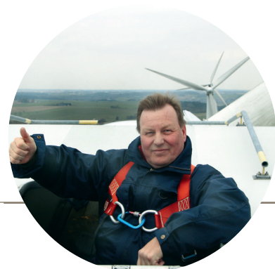
On-site service - (Engineer/container will provide expert service in even the most remote locations)