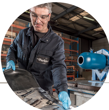
In-house service - (At the Service Center)